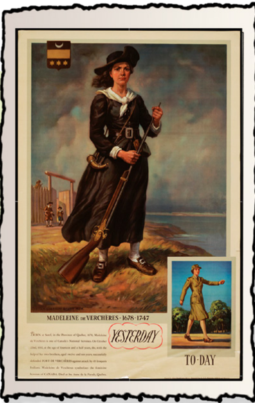
Rare Books & Special Collections, McGill Library