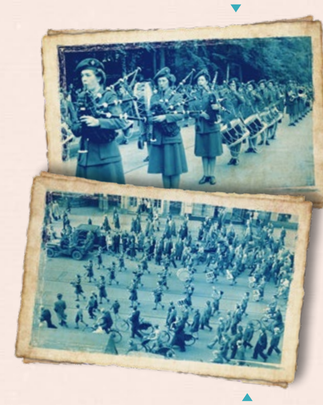
CANADIAN WOMEN'S ARMY CORPS PIPE BAND PARADING THROUGH AMSTERDAM, NETHERLANDS, 17 OCTOBER 1945.

CANADIAN WOMEN'S ARMY CORPS PIPE AND BRASS BANDS PREPARING TO TAKE PART IN THE CWAC ANNIVERSARY MARCH PAST APELDOORN, NETHERLANDS, 13 AUGUST 1945 (LT. DAN GURAVICH/CANADA DEPT. OF NATIONAL DEFENCE/COURTESY LIBRARY AND ARCHIVES CANADAPA