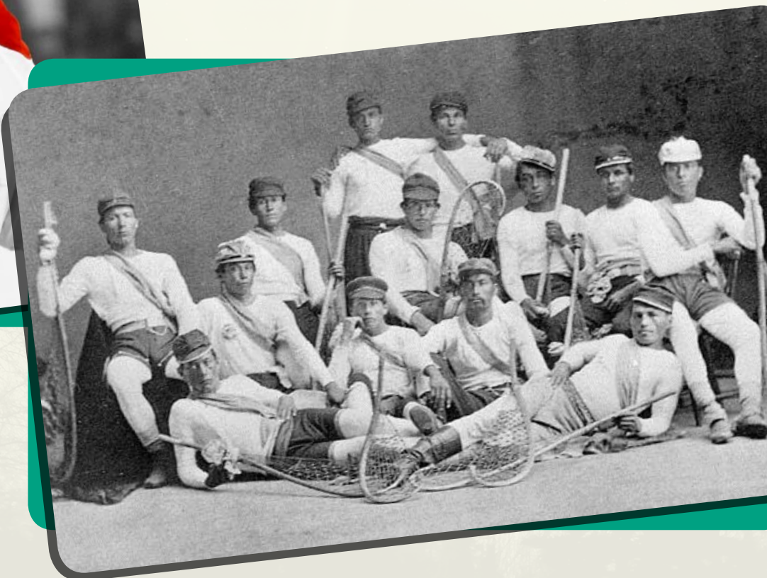
Lacrosse Champions. Men from Kanien'kehá:ka (Mohawk Nation) at Kahnawà:ke who were the Canadian lacrosse champions in 1869. ►