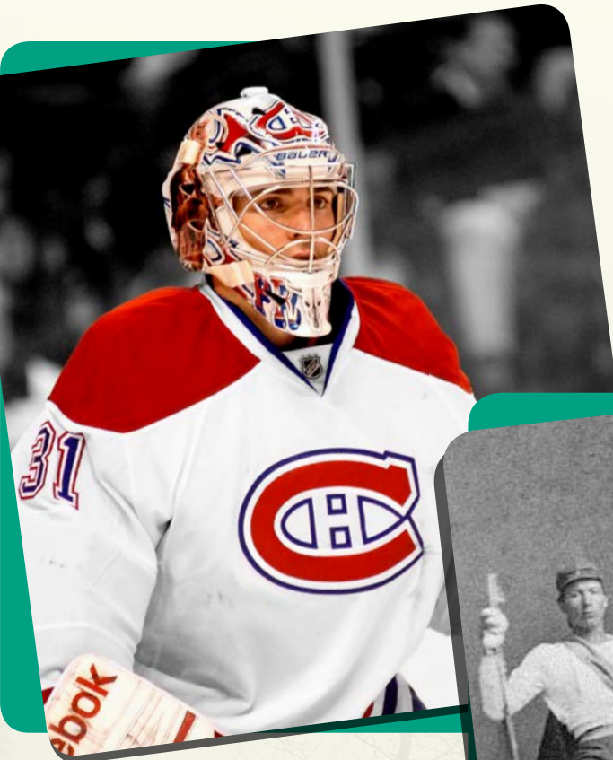
Montreal Canadiens goalie Carey Price, #31.